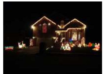
December: Kevin & Karen Campbell 3008 Bluffhollow Gap